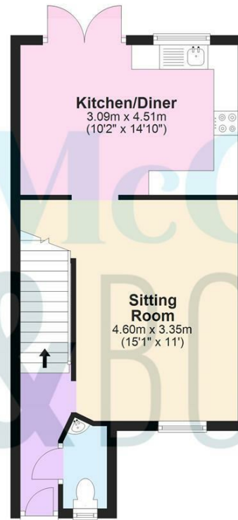
Ground Floor Approx. 38.1 sq. metres (410.4 sq. feet)